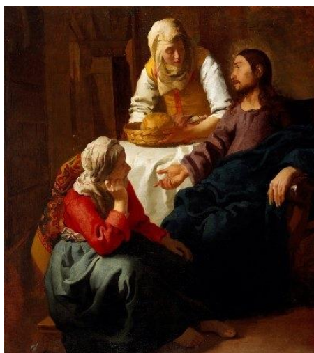
Christ in the house of Martha and Mary, Johannes Vermeer, 1654-1655

This title comes from a story in the Bible about two sisters who were visited by Jesus. One, called Mary, was happy to stop everything she was doing to hear what he had to say whereas Martha was worried about abandoning the housework.