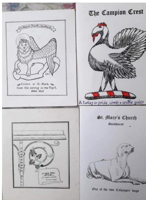
Four examples of the front covers

They are cleaning cards dating back as far as 1966 with examples intermittently up to 1994. All the tasks are clearly laid out and allocated accordingly. In addition the front covers of the cards have designs hand drawn by Len Pierce, a past Secretary of the History Society for thirty-three years. They are a charming example of treasures that are being kept for future generations.