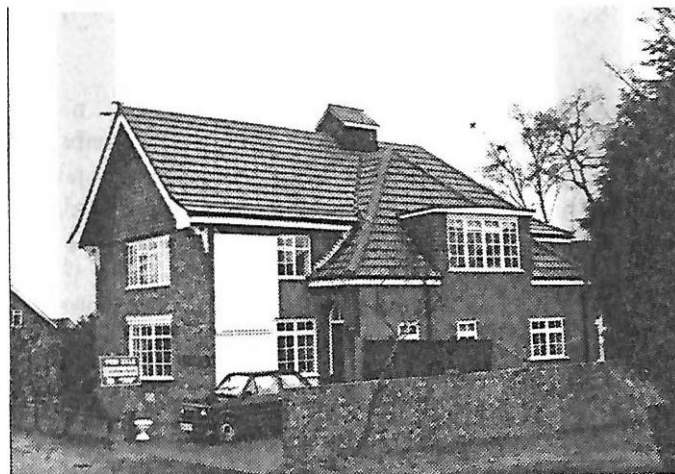
The Old Chapel in 1986