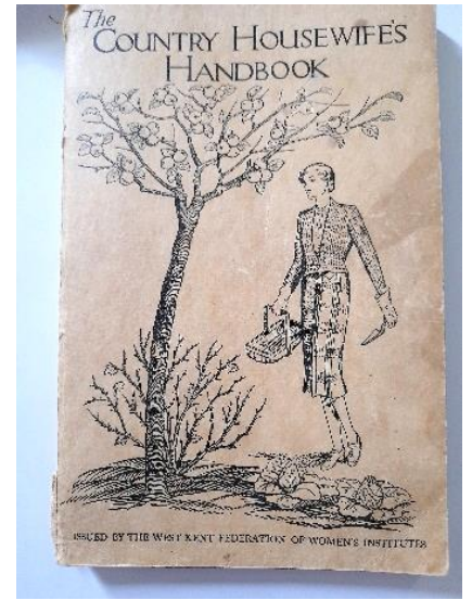
Published in 1939 by the West Kent Federation of WIs

The Kilndown branch of the WI was formed in 1919, a year before Goudhurst, and was one of the earliest village WIs in the country. For many years the group had over 40 members and were very active in the wider world of the WI, attending events around the County. It seems they were well known for putting on shows and musical entertainments. They carried on meeting during the years of WWII, with the emphasis on 'make do and mend' and performances to jolly everyone up!