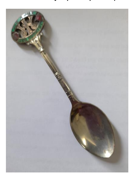
Teaspoon with WI Badge, date unknown